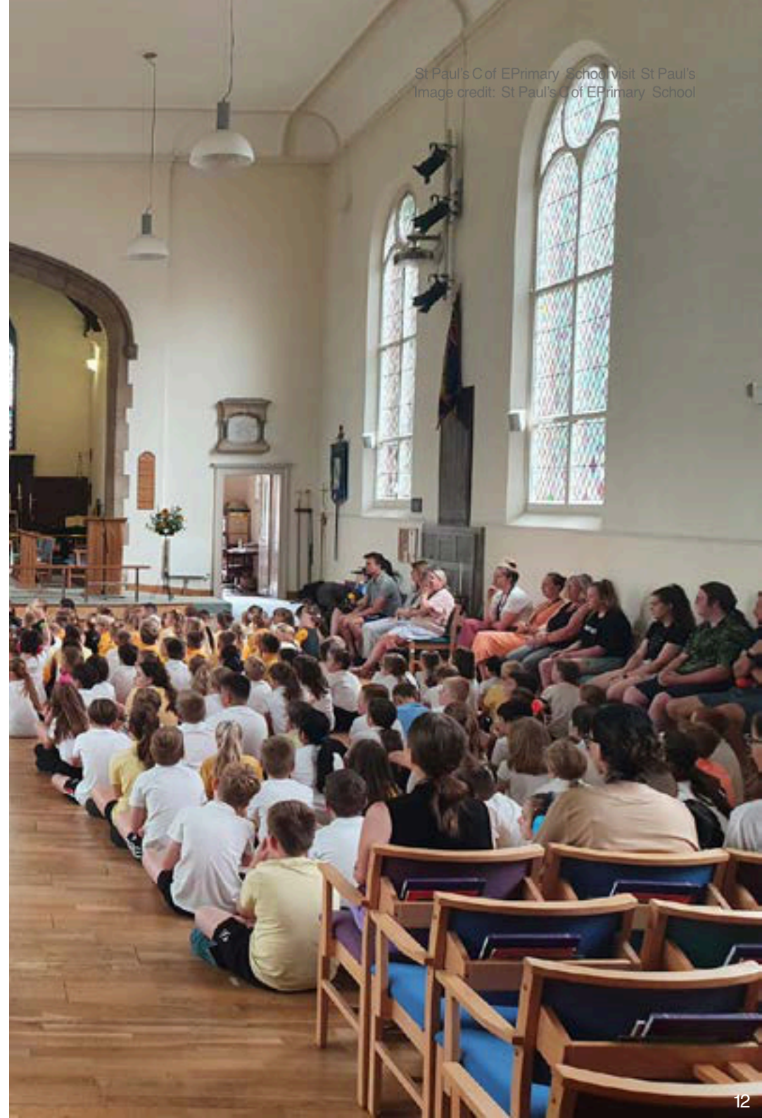
St Paul's C of E Primary School visit St Paul's

For young people at secondary school age, we have a long-running and close-knit youth group called SPOGs (St Paul's Older Group). Meeting on Sunday evenings, they have a spirit of friendship and support, with a range of fun activities and an annual residential trip. They explore their faith or what faith might mean to them through games, challenges, fun and food!