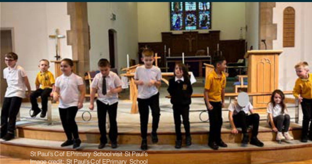
St Paul's C of E Primary School visit St Paul's

“There is a great community that feels like family, where everyone is welcoming and kind, the closeness within the church is inspiring, and what I love about SPOGs is how the staff listen to our ideas and respect us all. A church full of peace and new adventures, a safe space for young people to be themselves and discover who they are, with Sunday evenings that are fun and full of amazing, adventurous friends.” SPOG