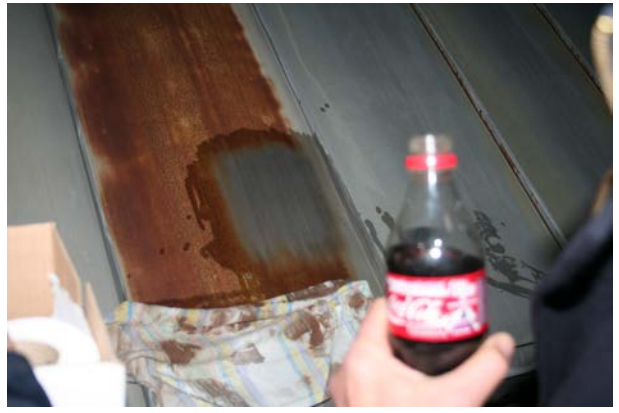
Discolouration of lead rich terne coated stainless steel