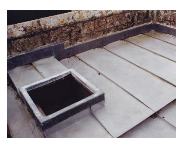
Awkward detail at verge with water running into upstand