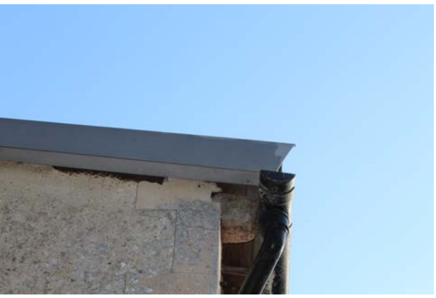
Straight verge fascia contrasts with uneven masonry