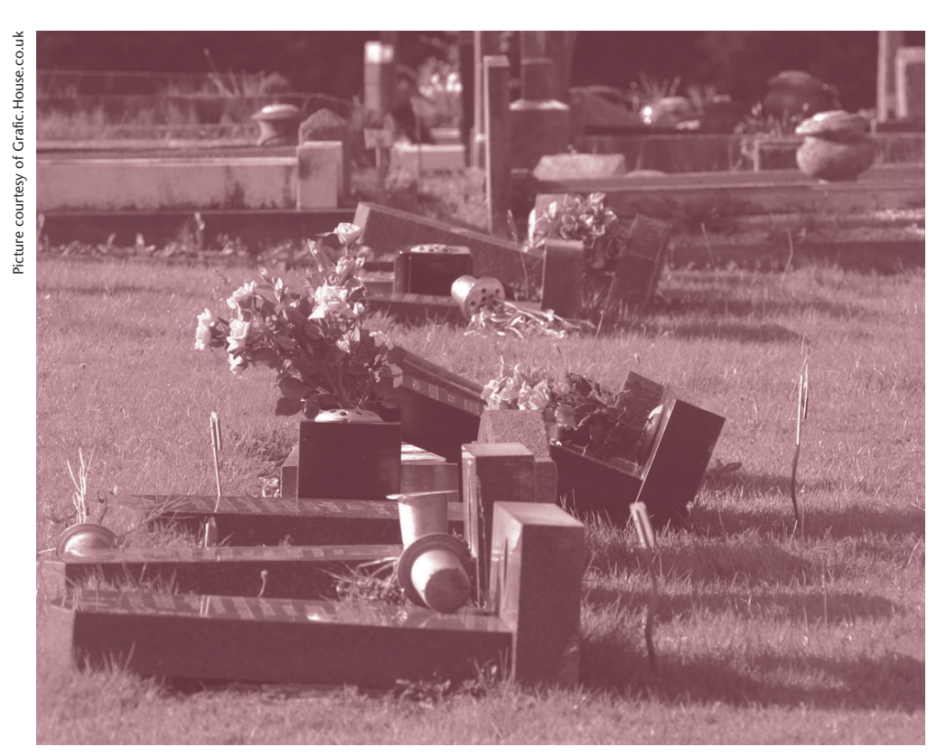
Result of health and safety testing in cemeteries

Desecrated. 372 tombstones felled ... but not by louts ... this time it's council morons. The Sun 8 September 2004 on testing by Camarthenshire County Council.