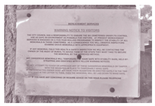
Notice of test in cemetery

Councils are increasingly aware that much of the public disquiet that memorial safety testing has generated can be reduced or prevented by a carefully considered programme of public information before testing begins.