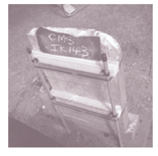
Method of support used by Stoke-on-Trent City Council

To cordon off a memorial with brightly-coloured hazard tape or meshing and warning signs, or to shroud it with a bright yellow plastic warning cover does not remove the risk posed by an unstable memorial. At best these provide a short-term solution by warning the public that a hazard exists. At worst they have provoked public outrage by striking a discordant note in the cemetery's setting.