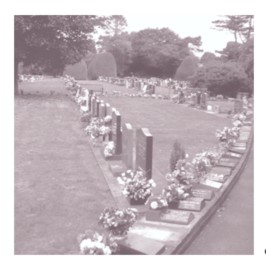
Cemetery with lawn memorials

Of the 600,000 people who die each year just over one third are buried. Of these about half have new graves, the rest being placed in existing graves. Since the mid-1950s the most common type of grave memorial has been the lawn memorial.