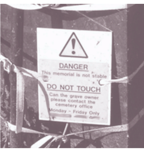
Notice on unsafe memorial