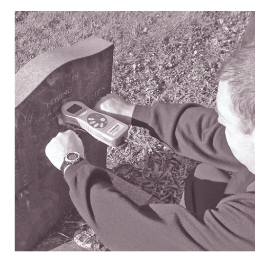
Force measuring instrument