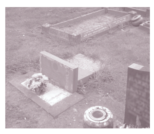
Inadequately secured memorial

In July 2001 HSE and the Local Authorities Enforcement Liaison Committee issued guidance (LAC 23/18) to local authority enforcement officers on the exercise of their powers under the Health and Safety at Work etc Act. The HSE later said it was not intended to be taken as guidance to burial authorities on their responsibilities. The document was subsequently withdrawn to avoid confusion. The Chair of the Health and Safety Commission (HSC) wrote to his regional directors and councils' chief executives in June 2004 to make it clear that HSE had issued no guidance on memorial safety and that it was a matter for individual burial authorities to determine. He urged burial authorities to follow industry guidance so that the issue was handled with the utmost sensitivity, referring to the adverse publicity and public anger caused by the indiscriminate action of a small number of local authorities.