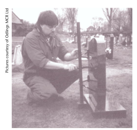
Odlings Makesafe support used by the Corporation of London

All lawn memorials in the City of London Cemetery that failed the safety test were stabilised on a temporary basis so that they were held safe and upright prior to permanent re-erection. Owners were written to and given six weeks to arrange for a memorial mason to repair in accordance with the NAMM Recommended Code of Working Practice. Alternatively, the Corporation would do the work for a fee. If an owner could not be traced the work was carried out by the Corporation and charged against the grave. It took just over a year to make safe and re-erect some 820 lawn memorials out of the total of 25,000 tested for stability.