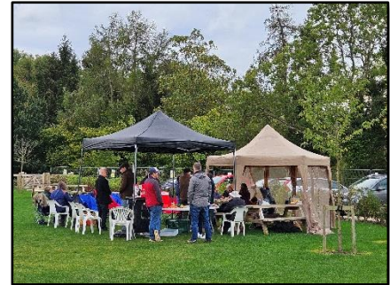
Outdoor Harvest Celebration by Church Allotment

There are 700 houses now occupied. Upper Lighthorne is separated from Lighthorne Heath by the B4100. As a new community there is a need for cohesion of the new and the old. There is a Community Champion working and living on the new development. She has been in post for two years and has been creating links with community members and she has eight years left of her fixed term contract. She is very keen to work with the Church to develop any opportunities that benefit the community.