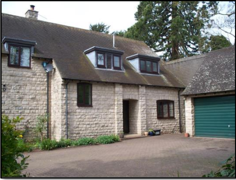
Rectory in Lighthorne

The Rectory is in Lighthorne, near the centre of the Mid-Fosse group. Built approximately 25 years ago from local stone, it is a four-bedroom family home close to the church with a secluded and well-established garden.