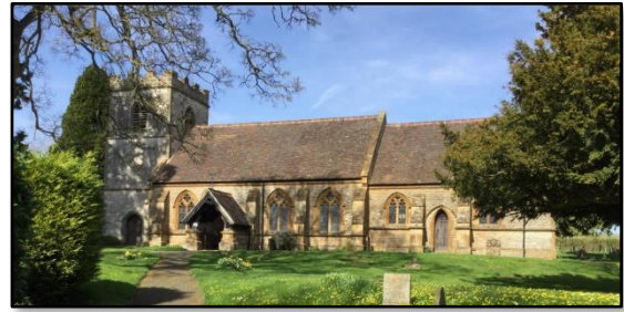
St Laurence Church, Lighthorne

Lighthorne is a picturesque village in the South Warwickshire countryside of about 270 houses. As you enter the village via steep hills you will approach the village green and see the local pub, 'The Antelope'. St Laurence Church has been in Lighthorne for seven centuries, and with one of the oldest bells (the Tenor) calling people to worship since the 16th century. We also have the remains of a Preaching Cross in the churchyard that is approximately one thousand years old. The worship style reflects a more traditional approach, although the church building has been used in the past to provide fun space for children to embrace church in a style that is more accessible, and there is a space at the back of the church, where pews have been removed, which is more flexible and enables a more social space, whilst maintaining the quaint feel of a village church.