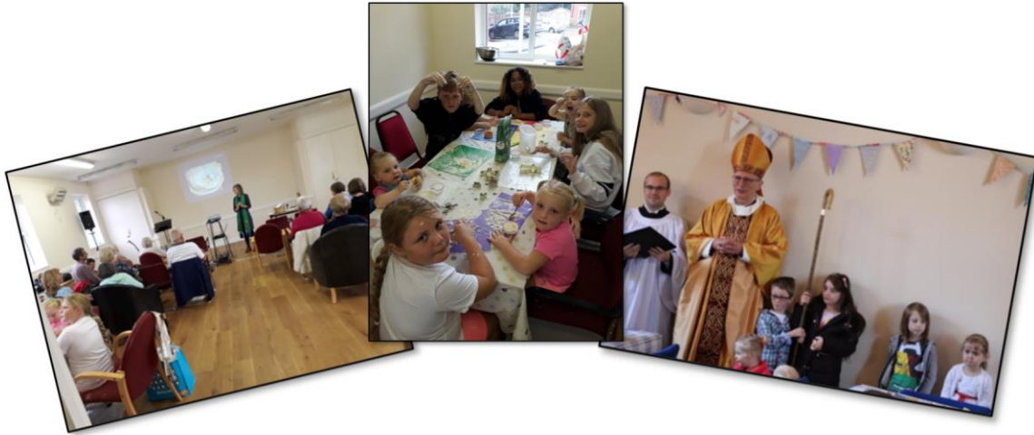
5th Sunday Services at Lighthorne Heath Village Hall

Lighthorne Heath is a separate community of approx. 370 houses. Its origin was as quarters for RAF service families, built in 1942, but eventually the houses were sold off, some to the District Council and some privately. Lighthorne Heath has a strong community feel. Historically this community has experienced a high level of social need, which has pulled the community together. In the early 80s there was a big influx of families, who were provided with the new stock of council housing. The village has worked through many social challenges that arose from placing many people in need together. Now, newcomers to the village comment about how quiet it is and how welcoming people are.