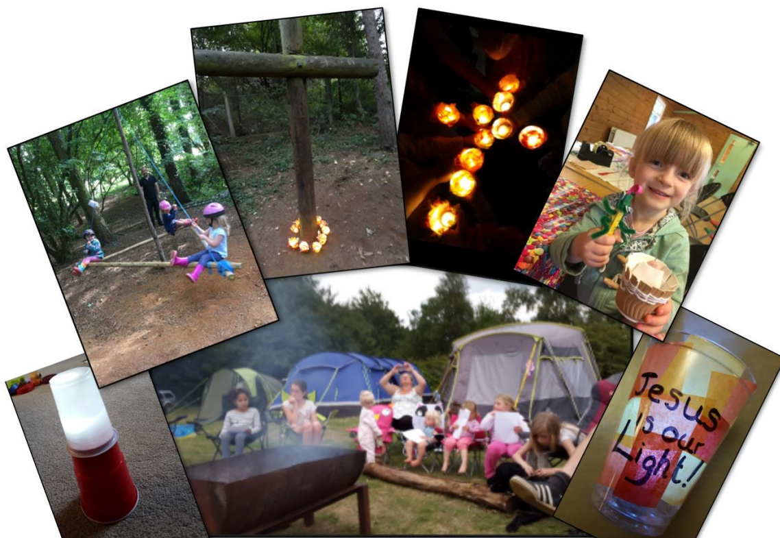
Community Camp and Messy Church

Previously, whilst capacity allowed, many children and young people from unchurched families attended weekly youth groups and Falcon or Venture Camps from 2003, with an average of 22 per year. We also, organised and ran five annual Community Camps, which welcomed 40 – 45 people (young and older). We have sought to engage the community through events outside of church buildings, for example by giving away free bacon butties on the green by the shop, a free car wash, 'treat or treat', and providing a free skip for the community to use at Easter as a physical demonstration of the gospel – bringing our rubbish to Jesus, who sorts it out.