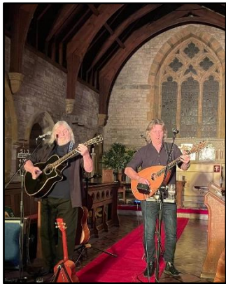
Folk Concert by Show of Hands

The church building and the churchyard are well maintained, and there are assets within a Trust that supports with the fabric of the building. There is a team of local people who clean the church and provide flowers. There is a Rota of people to ensure that the church building is open during the day as much as possible, so that it is available for quiet reflection and prayer or for visitors. There is an active Bell Ringing Group, and the Tower Captain operates a teaching centre. The links between the community and the church for shared events has been a strength, which recently involved a Folk Concert and a Flower Festival.