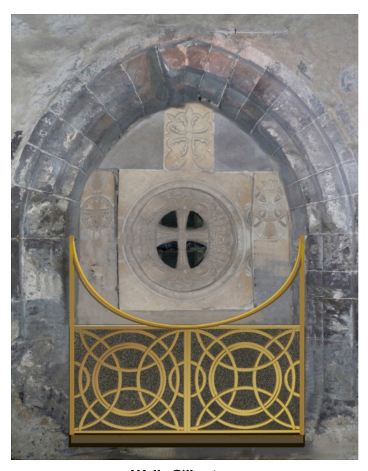
Wally Gilbert Aumbry to hold the Holy Oils, St David's Cathedral, Pembrokeshire, 2013

If an item is on loan or exhibition it is essential that the terms and responsibilities are understood in relation to their insurance, delivery and return. Condition reports should be carried out upon delivery and return. Also remember that loaned items will need insurance while in transit.