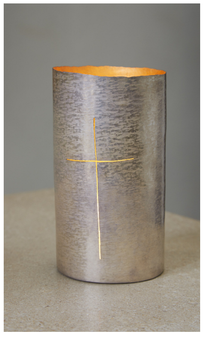
Giampaolo Babetto Candle holder for the Dick Sheppard Chapel, St Martin's-in-the-Fields, London, 2015-16, Curated by Modus Operandi

Some churches wish to include local schools, for example, in the design process. It is important that the terms of involvement are clear and that no commitment is made to use any of the suggestions in the form that they are presented. Considerable disappointment can be caused if working with local partners is not carefully considered and defined.