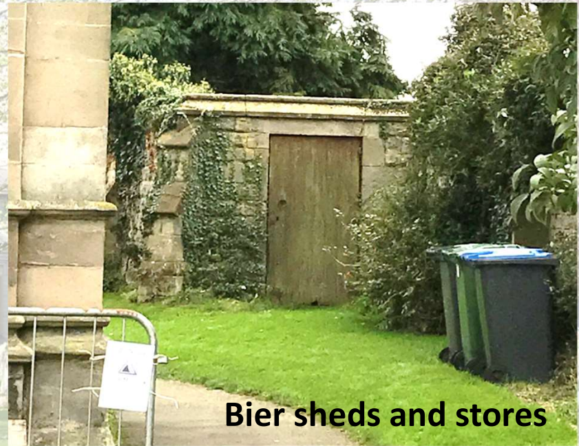
Bier sheds and stores