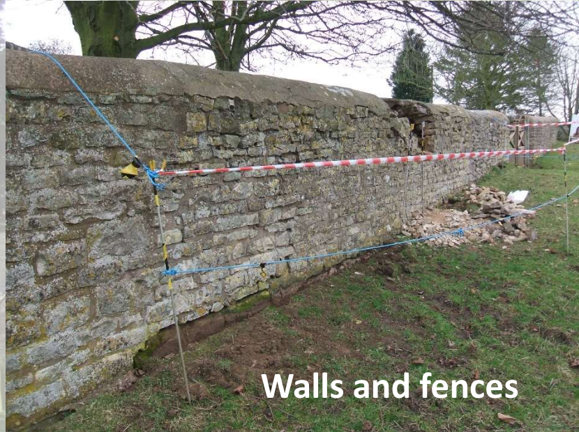
Walls and fences