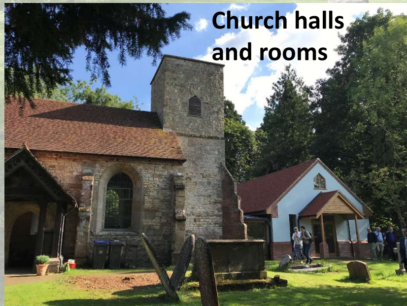
Church halls and rooms