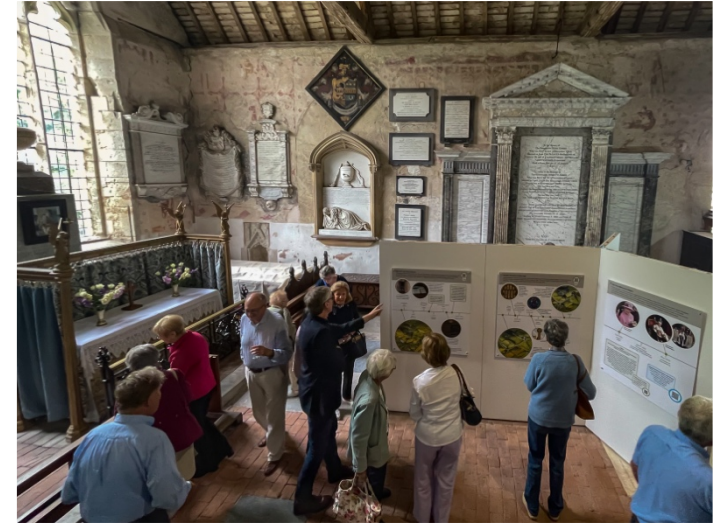
The new Saxon Sanctuary exhibition