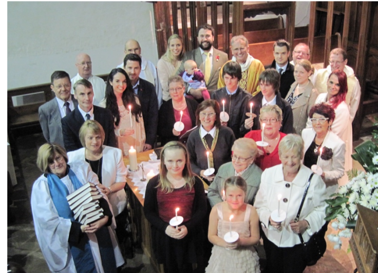
Confirmation service with the Bishop of Coventry