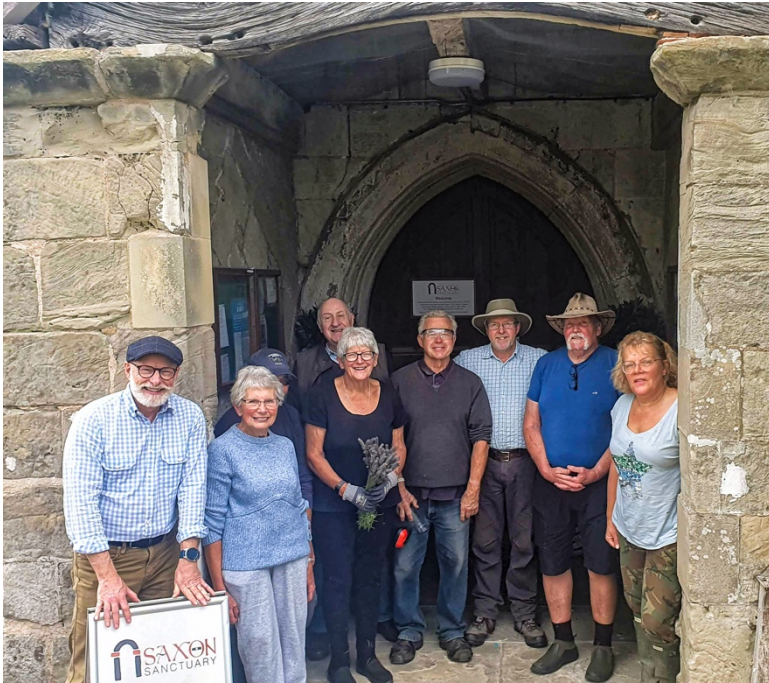
Taking a breather after work in Wootton Wawen churchyard