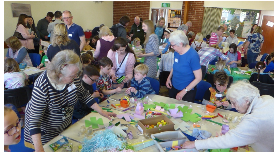
Easter workshop with 70 children, 2023