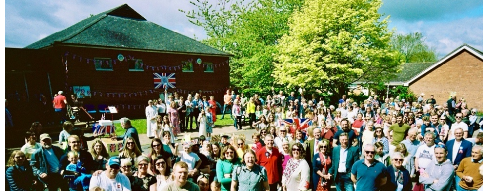
Coronation celebrations at the Church Centre

We have advanced plans to install a new heating system using heat pumps and solar panels as part of the church's aim to be net zero carbon by 2030.