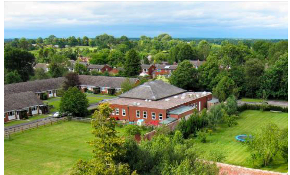
The Church Centre from the church tower