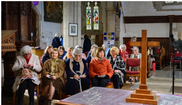
World Day of Prayer 2024