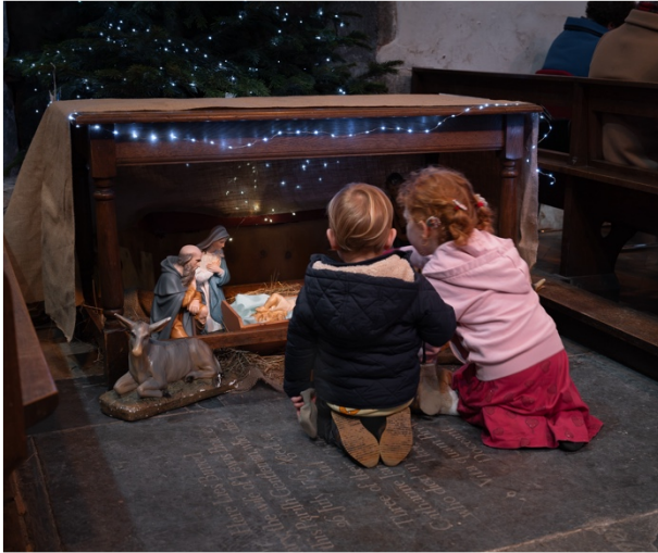
Christmas at St Peter's