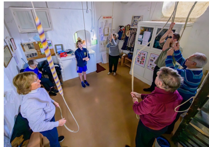
Ringing St Peter's 6 bells