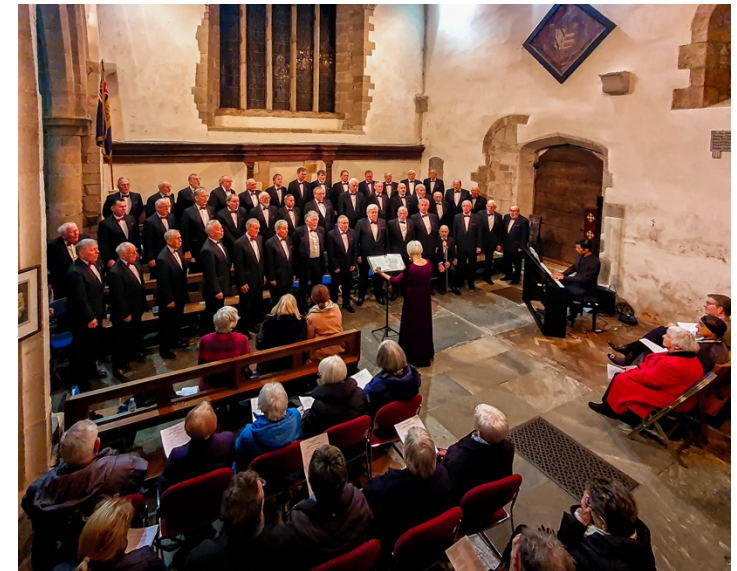
Alcester Male Voice Choir – giving one of many concerts at St Peter's