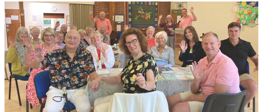
Bible Café at Claverdon