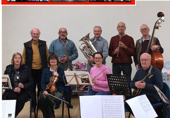
The West Gallery Band

Throughout Advent a decorated window in a village house was lit each night, followed by a blessing, carol singing and refreshments. Hundreds of villagers joined in!