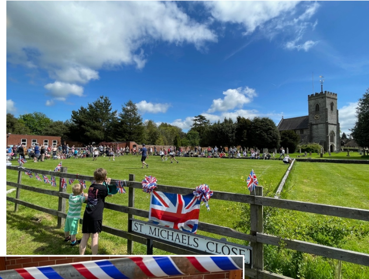
Children's games on the Glebe Field. (Church Centre on the left)