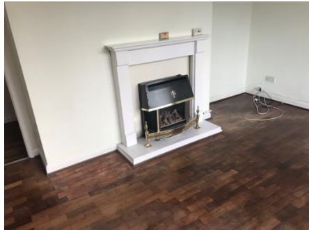
Images of Potters Green Vicarage

The vicarage is located directly next to Potters Green church. It has four good sized bedrooms, a sitting room, study, garage, a small garden and off-street parking.