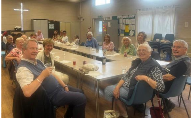
Fish and Chip Supper August 2025