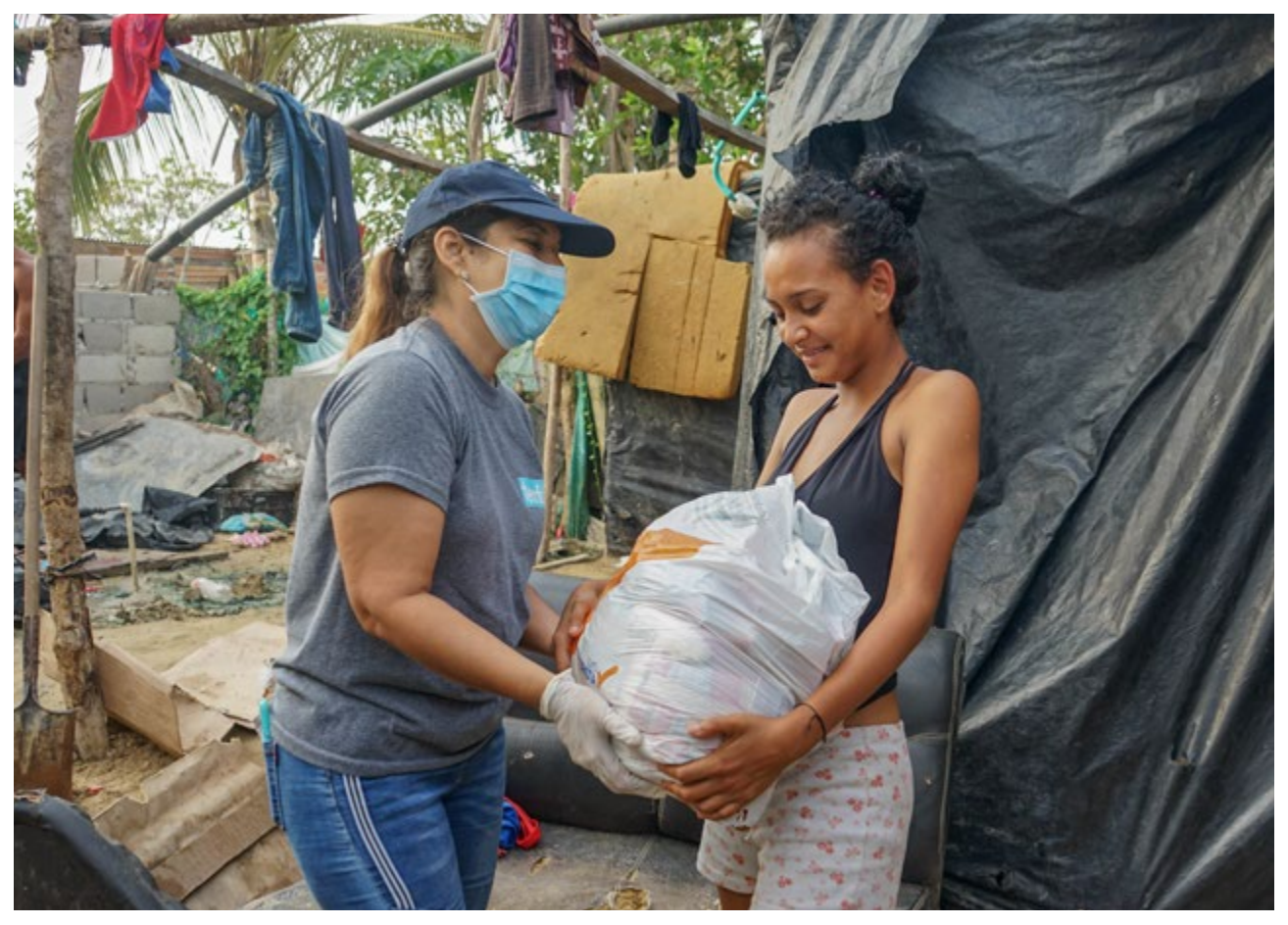
Food packages being delivered to vulnerable Venezuelan migrant families in Colombia