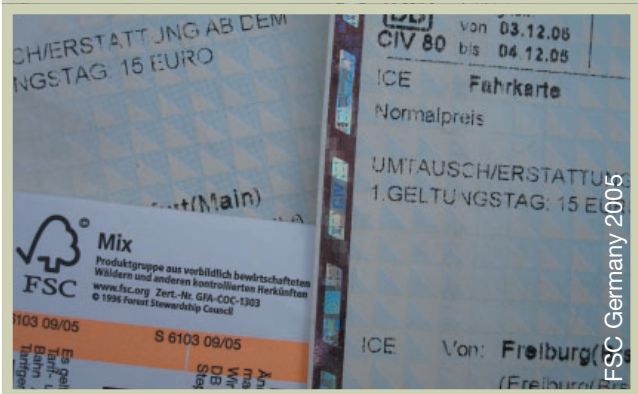
FSC Germany 2005