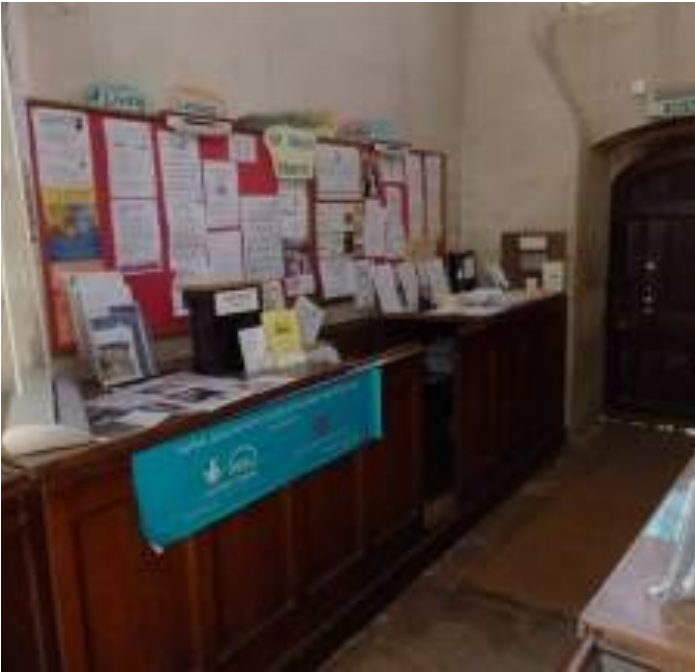
Below: Lydiard Tregoze, St Mary (Bristol). The entrance area before, and the proposed new design.