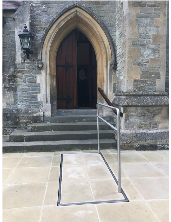
Below: Minsterworth, St Peter (Gloucester). Example of a bespoke CantiLift™ entrance lift .

If your proposals will change the external appearance of the building planning permission may be needed from the local authority.