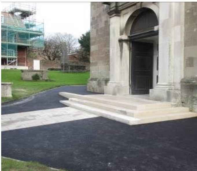
Below: Axbridge, St John the Baptist (Bath & Wells) before and after.