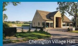
Cherington Village Hall

Delicious refreshments will be available and there will also be a raffle with terrific prizes.